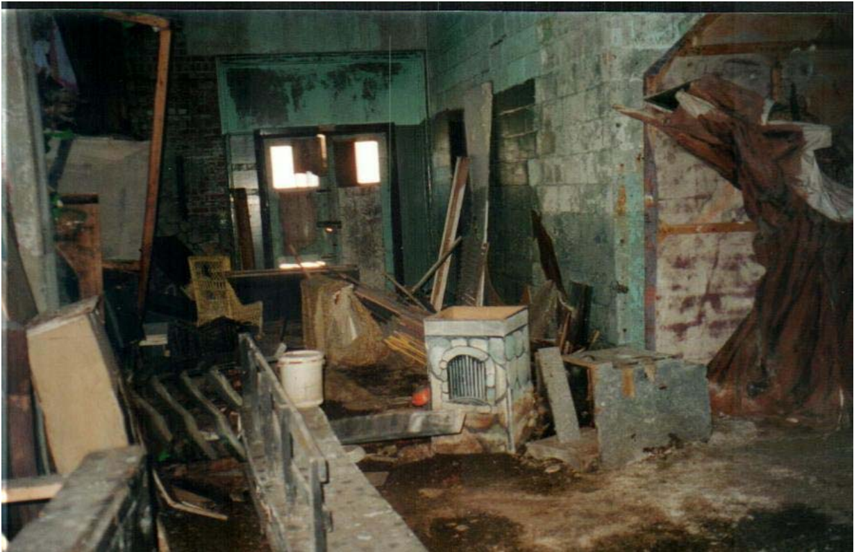
Stored Materials in Hangar at Floyd Bennett Field