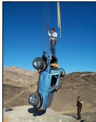
Vehicle being hoisted from a mine shaft on BLM land.

We found that NPS has mitigated many of its high-risk, easily accessible abandoned mine sites; however, there are hundreds, if not thousands, of sites that still need to be addressed. At one park, the abandoned mine inventory includes over 600 sites, and NPS officials have inspected less than half of the sites on the 1.4 million acres comprising the park. While NPS has a more effective program, current funding for NPS' abandoned mines program is inadequate to address these hazards, and NPS has failed to develop a credible estimate of the total cost of mitigation.