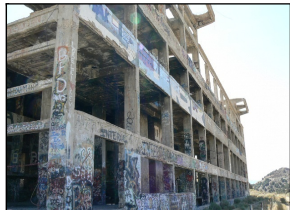
Dilapidated mill building at American Flat Mill.

In July 2007, we visited the American Flat Mill site, located near the town of Virginia City, NV, where a teenager died climbing the stairs on his all-terrain vehicle. The mill is a large, two-story, dilapidated concrete structure where ore was processed in the 1920s using cyanide. The site is an extremely dangerous physical safety hazard. It is easily accessible, with few fences, and is a popular "party" hangout for local teens. Most of the structure has no outside walls and there are large holes in the floors that could easily result in a serious injury or death.