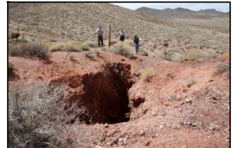
Visitors camp near this mine opening in the Greenwater Mining District.

We noted three open mine shafts at the Greenwater Mining District. Two of the shafts were well fenced; however, the third was easily accessible and posed a danger to park visitors. This shaft was several hundred feet deep and within close proximity to an area where visitors had been camping. A fence around this mine shaft was dilapidated and was not effective in keeping visitors away from the “ant-trap”-like opening.