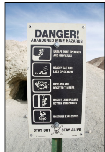
Warning sign that could be used as a minimum precaution at abandoned mine sites.

The overall solution for cleaning up abandoned mines is not simple. It calls for a complex and concerted effort on the part of the Department, including the immediate mitigation of known hazardous sites, a calculated effort to identify and inventory unknown sites, a methodical design to address abandoned mines comprehensively, and a strategy to secure the necessary funding for this costly endeavor.