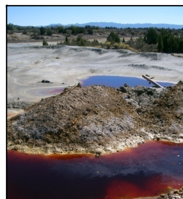
Acidic pond at Caselton Tailings site