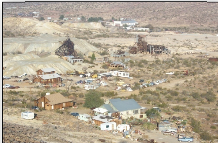
Residents and businesses in trespass in Red Mountain, CA, near mine tailings.

Historical trespass on BLM land is known to exist at many locations throughout the West, according to a BLM official. This trespassing includes commercial activities and residential development on abandoned mine sites on federal land. Two of the abandoned mine sites we visited had residential and commercial development in areas with safety and potential environmental hazards. This residential and commercial trespass hinders BLM's efforts to mitigate sites because of the regulatory and legal delays associated with evicting trespassers and physically removing homes and commercial facilities.