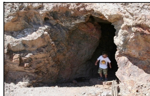
Young boy exiting a mine adit with a collapsing roof in Death Valley National Park. (OIG Photo)