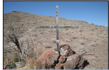
Site near Beatty, NV, where a young girl fell to her death in an open shaft.

More recently, in 2007, near BLM's Windy Point Recreation Area, Kingman, AZ, a young girl was killed after falling into an open abandoned mine. The girl and her sister were riding an all-terrain vehicle, ran off a trail, and fell into a 125-foot mine shaft. The sister was seriously injured and spent the night in the mine before being rescued. The shaft is on a small privately owned parcel surrounded by BLM property. BLM maintains a nearby campground and a road leading to the area where the death occurred. A barbed-wire fence, provided by BLM, and warning signs were erected around the abandoned mine shaft shortly after the accident.