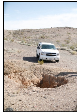
Dangerous mine shaft at the Johnny Shaft site.

At two sites, we found mine shafts on roads that were large enough to easily swallow entire vehicles. In both cases, there were no fences or signs warning the public of the danger. At the Gold Cycle site in the preserve, a ladder going into the mine provided easy access to the mine shaft. At the Johnny Shaft site, we observed that the road led directly to a mine with a 400-ft deep shaft.