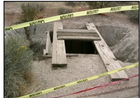
Open shaft near road in Red Mountain, CA.

In response to our Flash Report, BLM reported that several safety hazards had been fenced and posted with warning signs. The off-road vehicle route on the tailings dam was closed and an alternative route was constructed. BLM also began a formal process to assess health risks to the public from environmental contamination at the site. Periodic public meetings are being conducted to inform residents of BLM's progress in mitigating site hazards. We are encouraged by the steps being taken as a result of our Flash Report to address hazards in the Rand Mining District. However, the disturbing fact remains that hazards in the District were suspected or known to BLM for many years before anything was done to evaluate and mitigate them.