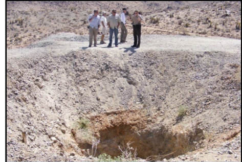
Open mine shaft at the Goat Basin Mine where a visitor died.

According to a BLM official, there are many such openings in the area but BLM has not inventoried these sites and has no plans to mitigate the hazards. After our site visit, we made recommendations to BLM about the safety concerns at the Goat Basin Mine, and BLM took immediate action and erected a fence around the opening.