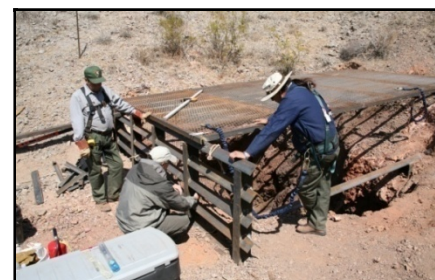
NPS personnel from Joshua Tree National Park installing a prefabricated cover at Lake Mead.

At Joshua Tree National Park, NPS has the capabilities to mass produce prefabricated mine covers and gates. This enables a large number of sites to be mitigated economically and efficiently. We believe this approach is a good model that could be expanded within NPS and adopted by BLM.