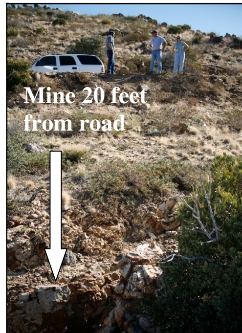
Dangerous mine shaft next to BLM-maintained road near Kingman, AZ. This shaft was a short distance from a similar hazard where a young girl died in September 2007.

At another mine northeast of Kingman, the COD Mine, we found physical and potential environmental hazards. The private land owner who lived directly below the mine believed his well water was contaminated by the COD Mine. BLM contacted the mine claimant, who owned the mineral rights, several times in 2005 to notify him of site conditions, including abandoned