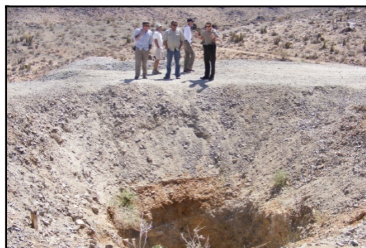
Open mine shaft at the Goat Basin Mine where a visitor died.

Visible mine tailings have migrated down the surface of Caselton Wash (a seasonal waterway that flows only during rains) toward Meadow Valley Wash to within about 3 miles of the town of Panaca and local water wells. An engineering evaluation conducted on the Caselton tailings stated that a catastrophic release of tailings could "severely and intensively impact water quality in Meadow