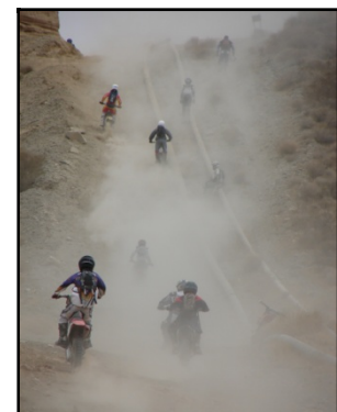
Off-road vehicle trail on contaminated tailings in Randsburg, CA.

In March and May 2007, we visited the Rand Mining District near Ridgecrest, CA, because soil samples taken by BLM in 2006 identified dangerous levels of arsenic contamination thousands of times higher than Environmental Protection Agency (EPA)-recognized safe levels. BLM had known about this potential contamination for decades but had never taken samples to assess the danger to the public. We confirmed these serious environmental hazards and also found numerous physical safety hazards. These hazards were endangering the residents of Randsburg and Red Mountain as well as thousands of off-road vehicle recreationalists who routinely visit the area. BLM estimates that costs to mitigate environmental and safety hazards in the District could exceed $170 million. Due to the potential risks to the public, we issued Flash Report No. C-IN-BLM-0012-2007, “Environmental, Health and Safety Issues at Bureau of Land Management, Ridgecrest Field Office, Rand Mining District, CA.”