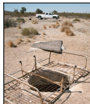
Open shaft near Barstow.