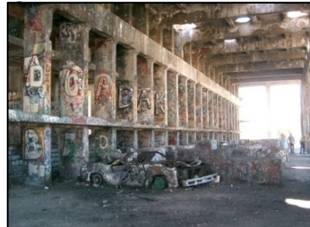
American Flat Mill where teen died riding an all-terrain vehicle.

In 1996, at the American Flat Mill near Virginia City, NV, a teenager died while climbing stairs on his all-terrain vehicle inside the structure. This extremely dangerous, dilapidated structure, which was built in the 1920s, is easily accessible with few fences and is a popular hang-out site for teens. While not documented, a BLM official told us that many other serious injuries have occurred at the site requiring flight-for-life helicopter rescues. BLM has not permanently mitigated the site because of concerns about the mill's "historical value."