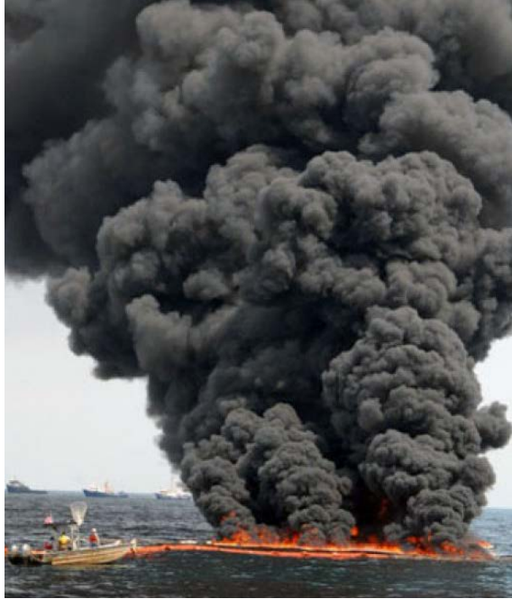
Figure 2. In situ (onsite) burning of spilled oil was one containment technique used during the Deepwater Horizon disaster.

The OSPD deals with regulatory gaps by issuing a Notice to Lessees (NTL) to clarify the regulations and strengthen the effectiveness of oil spill response plans. Although NTLs are not meant to stand in for permanent regulatory changes and are only considered guidance, the industry representatives we spoke with expressed concern that using NTLs in this manner might be binding. Instead, industry prefers making changes through the formal rulemaking process to facilitate public review and comment before a proposed rule becomes regulation.