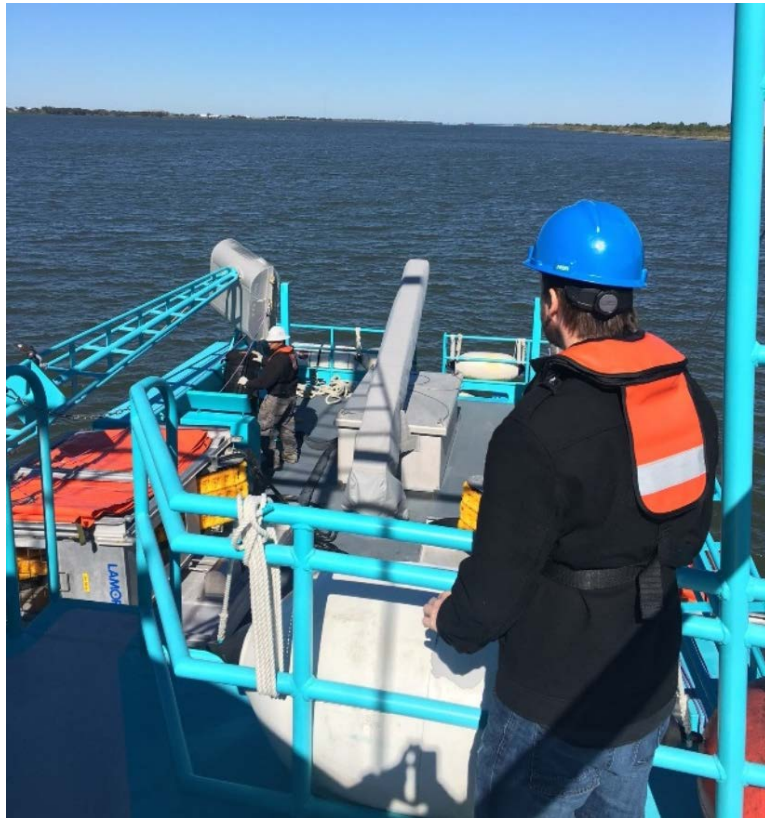
Figure 1. OSPD preparedness analyst on a response vessel observes the activities of an oil spill removal organization.

Although we recognize that the OSPD has designed a strong GIUE program, we found three issues that impact GIUEs.