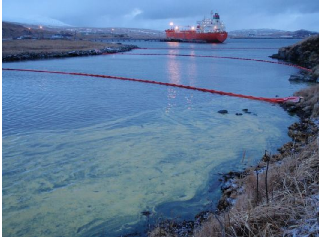
Figure 3. Boom equipment being used to contain an oil spill off the coast of Alaska.

The industry and Government officials we interviewed support oil spill research in U.S. open waters, with testing conducted under a highly planned, coordinated program, closely supervised by Government representatives. A promising example of such testing exists in Norway, which has conducted open-water oil spill research in the North Sea for 30 years. Representatives of the Norwegian Clean Seas Association for Operating Companies, an oil spill removal organization, conduct research annually, but only after completing a rigorous regulatory permitting process. The amount of discharged oil ranges from 100 to 150 cubic meters (equating to 629 to 944 barrels), considered sufficient to enable realistic spill scenarios.