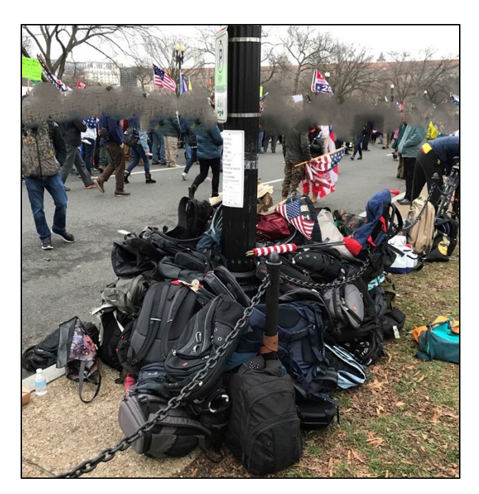
This photo was modified by the OIG to obscure features.

USSS officers and demonstration volunteers collected many of the abandoned bags and placed them into piles on Constitution Avenue, and USPP K-9 officers then swept the bags for explosives. The officers said that they were unable to sweep all the bags because there were so many, and some of them were buried under piles of other bags.